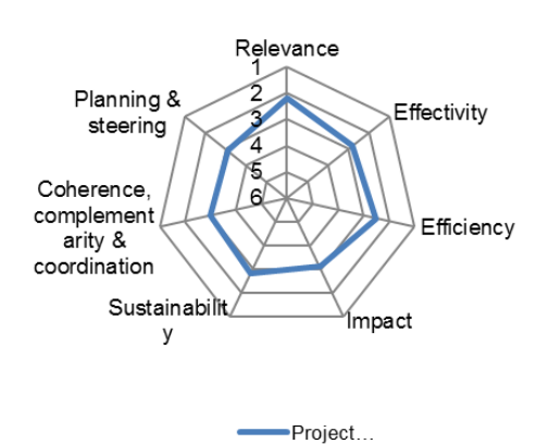
Figure 1: spider diagram – evaluation results

Secondly, the transport sector in India has a high potential for the reduction of GHG emissions. The potential can only be realized if the plans for low carbon mobility are implemented. Projects that aim to mitigate climate through GHG emission change reduction which require substantial investments should establish therefore from the beginning partnerships with funding institutions which have the potential to fund the necessary investments.